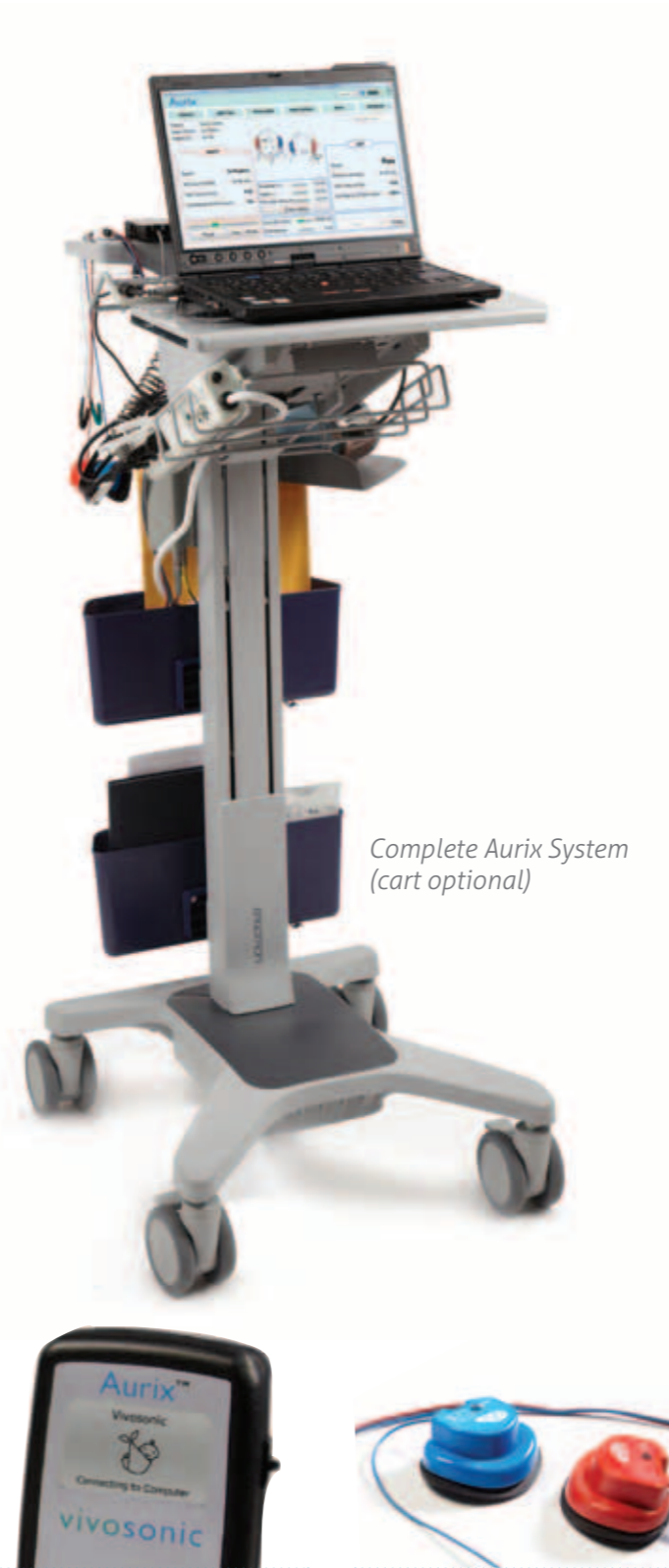
Complete Aurix System (cart optional)